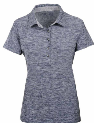
Heather navy / Light Heather Grey