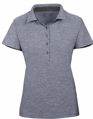
Light Heather Grey / Heather Black