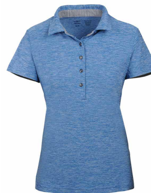
Heather blue / Light Heather Grey