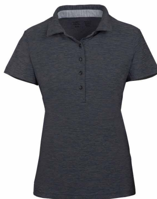
Heather Black / Light Heather Grey